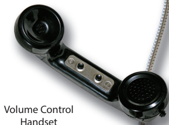
Volume Control Handset