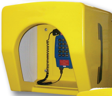
AB-1000 with high performance polyurethane acoustic liner 1