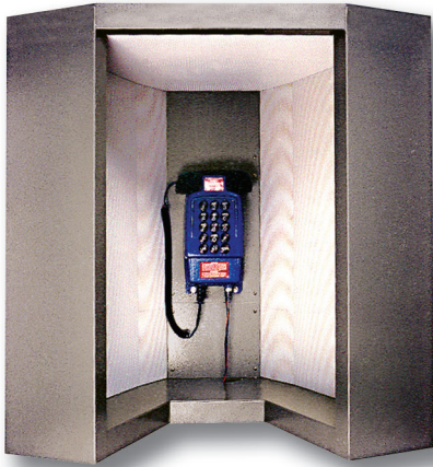
AB-100 with perforated galvanized steel liner 1