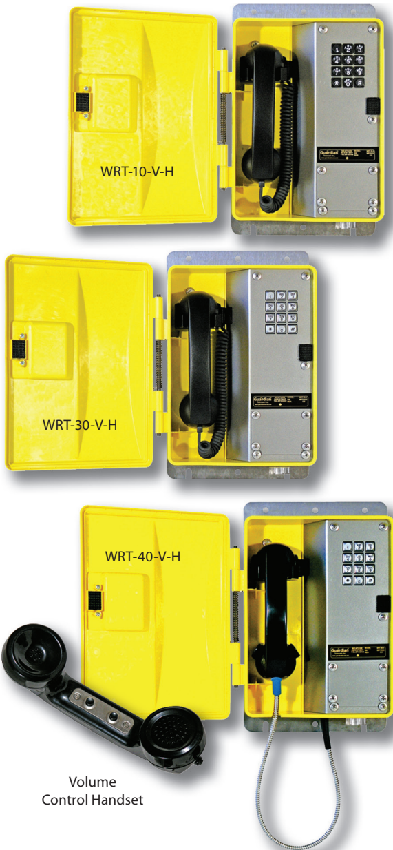
Volume Control Handset