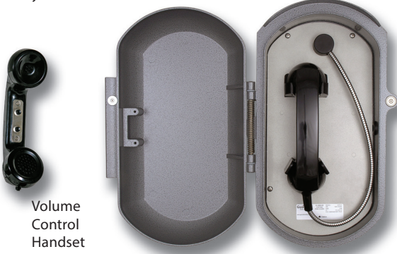
ACR-41 Cast Aluminum Ringdown with Armored Handset Cord