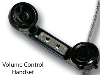
Volume Control Handset