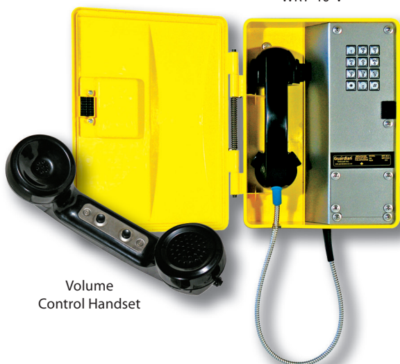
Volume Control Handset